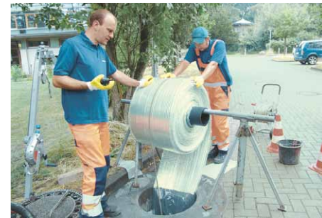
Pulling in the heat exchanger

If sewer rehabilitation is not necessary, but you wish to recover heat from sewage anyway, it is of course possible to install the system without an outer liner.